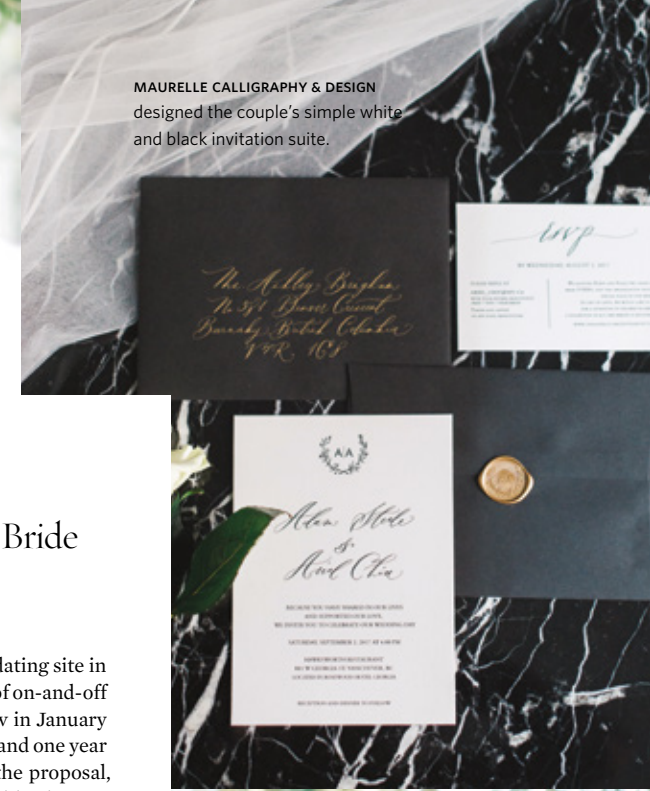
MAURELLE CALLIGRAPHY & DESIGN designed the couple's simple white and black invitation suite.