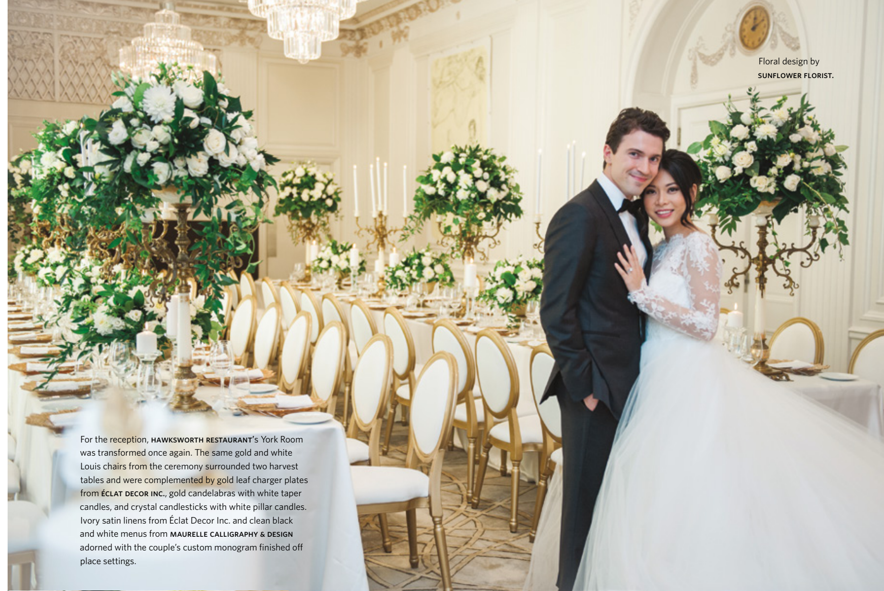
Floral design by SUNFLOWER FLORIST.