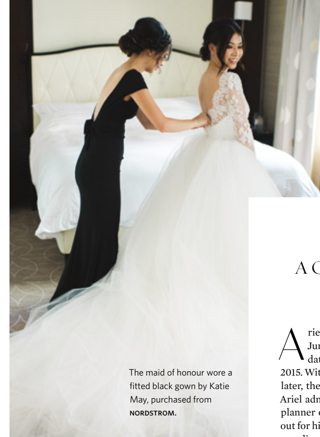
The maid of honour wore a fitted black gown by Katie May, purchased from NORDSTROM.