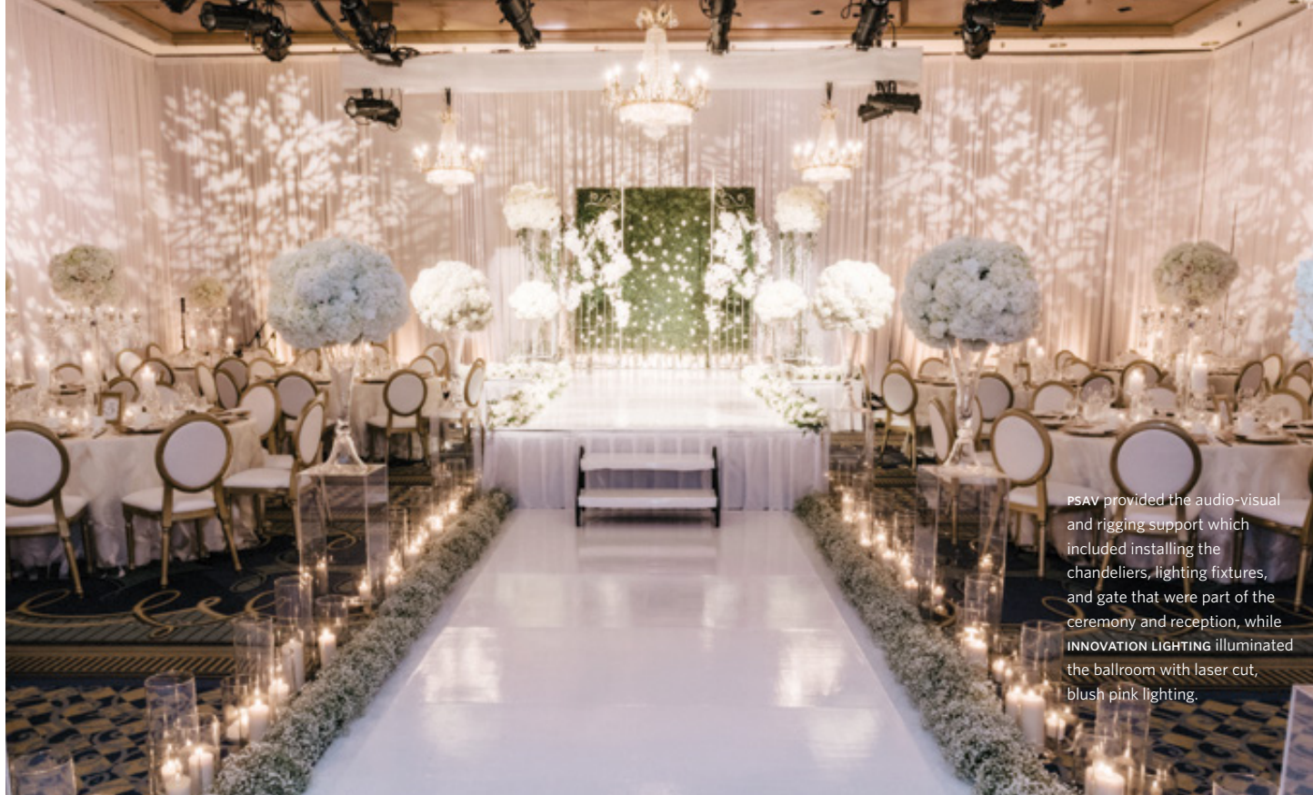
PSAV provided the audio-visual and rigging support which included installing the chandeliers, lighting fixtures, and gate that were part of the ceremony and reception, while INNOVATION LIGHTING illuminated the ballroom with laser cut, blush pink lighting.

“The gates were covered in orchids and it was truly the most romantic spot for a wedding ceremony. Surrounded by candlelight and sparkling chandeliers, the stage was pure magic.” –coco