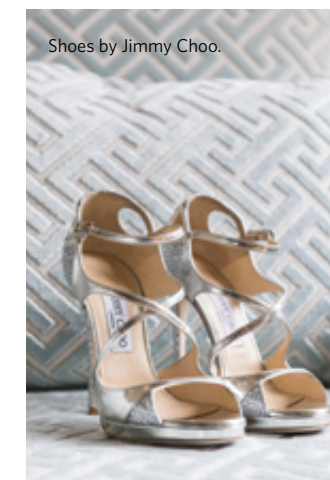
Shoes by Jimmy Choo.