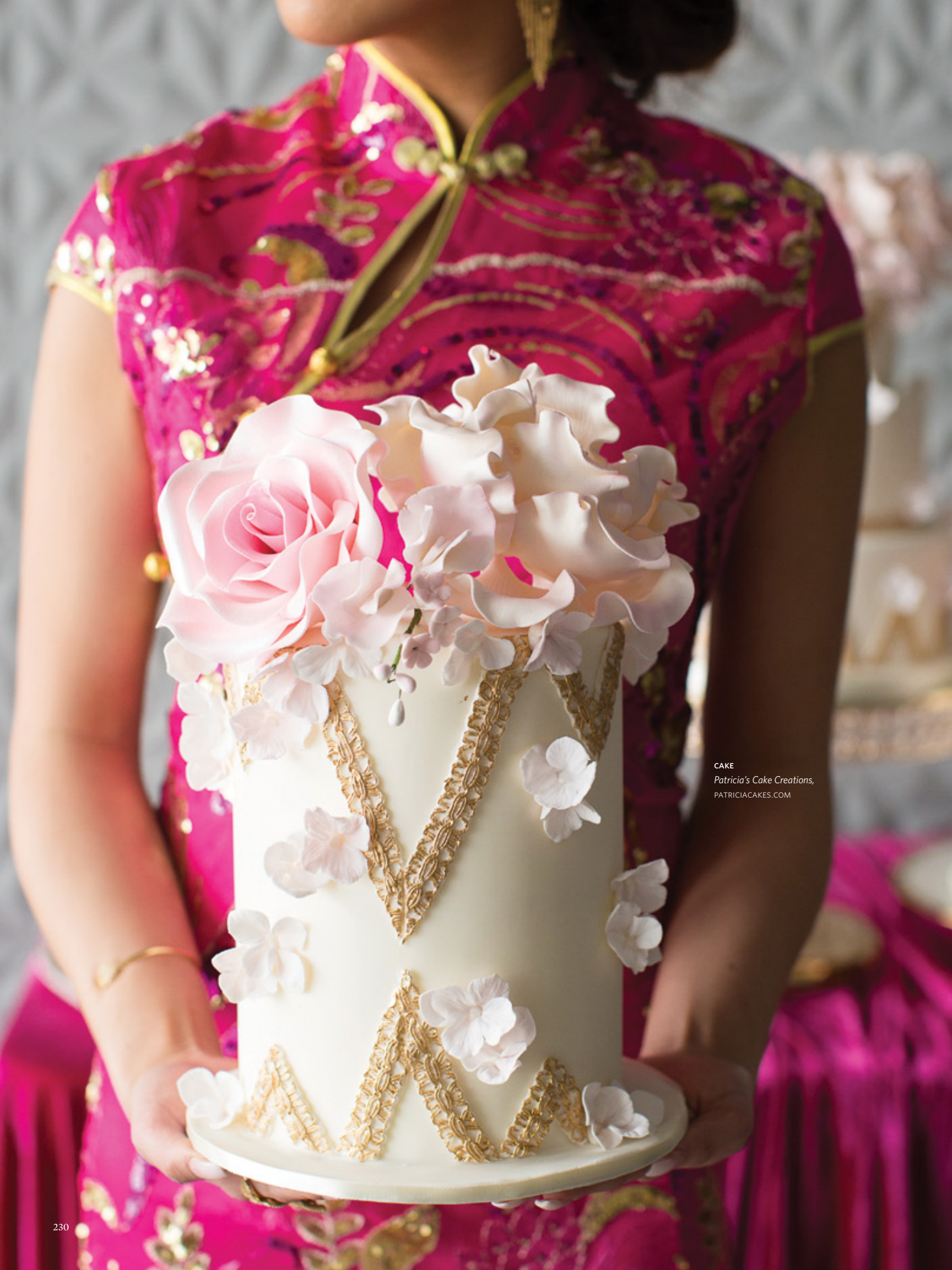
CAKE Patricia's Cake Creations, PATRICIAKAKES.COM