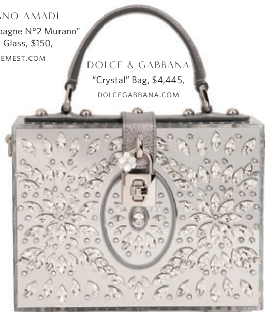
DOLCE & GABBANA "Crystal" Bag, $4,445, DOLCEGABBANA.COM