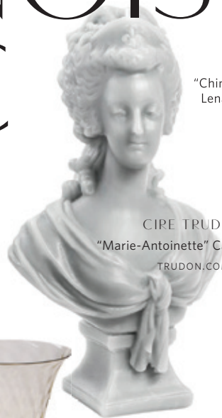
CIRE TRUDON "Marie-Antoinette" Candle, $145, TRUDON.COM