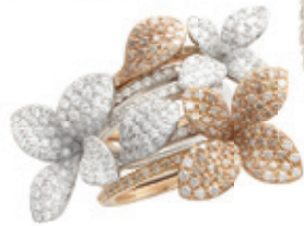
PASQUALE BRUNI "Petit Garden" Ring, price available upon request, available at Royal de Versailles, ROYALDEVERSAILLES.COM