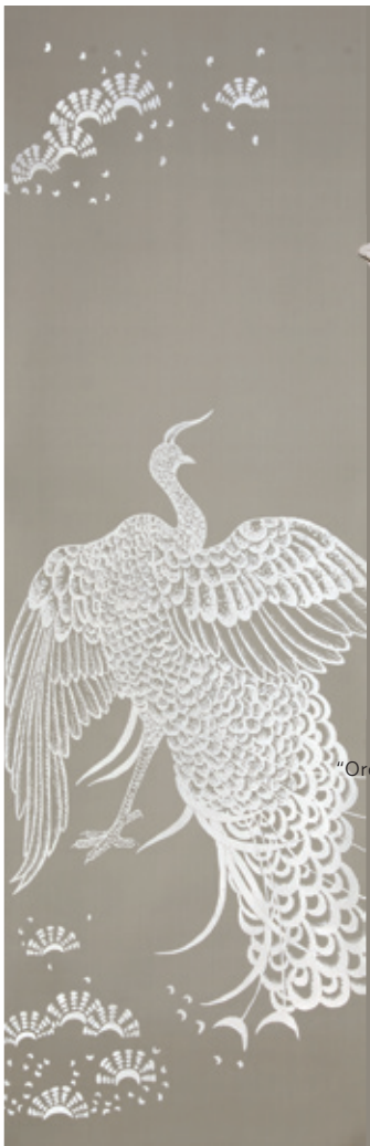
DE GOURNAY "Whistler Peacocks on Lead Grey Dyed Silk" Hand-Painted Wallpaper, DEGOURNAY.COM