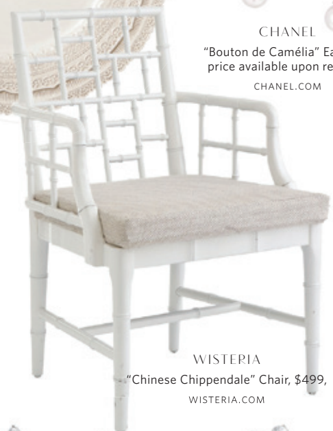
WISTERIA "Chinese Chippendale" Chair, $499, WISTERIA.COM