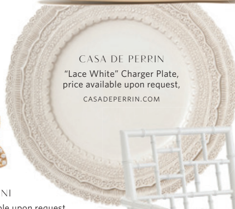
CASA DE PERRIN "Lace White" Charger Plate, price available upon request, CASADEPERRIN.COM