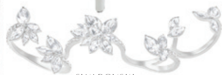
SWAROVSKI "Gardenia" Ring, $299 SWAROVSKI.COM