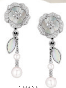
CHANEL "Bouton de Camélia" Earrings, price available upon request, CHANEL.COM