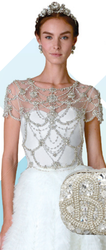
Fall 2016 Gown, MARCHESA.COM

Embody a queen with rare jewels and priceless gemstones.