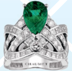
Joséphine Eclat Floral Ring, price upon request, CHAUMET.COM