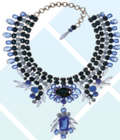
Montana Blue and Sapphire Drop Necklace, $2,600, JEWELSBYALANANDERSON.COM