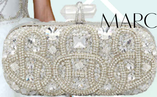
Lily Medium Embroidered Stone Box Clutch, $4,330, MARCHESA.COM