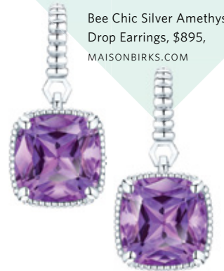
Bee Chic Silver Amethyst Drop Earrings, $895, MAISONBIRKS.COM