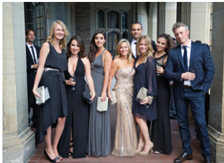
» GARDEN VIEW A cocktail reception followed on the outdoor terrace overlooking the estate's breathtaking gardens. UK singer/songwriter Shannon Saunders performed as passed hors d'oeuvres, catered by Liberty Entertainment Group , were served. Eagles Nest Golf Club provided a hand carved prosciutto station for guests to further indulge.