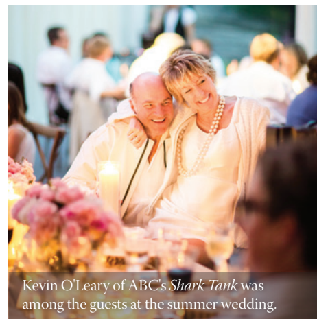
Kevin O'Leary of ABC's Shark Tank was among the guests at the summer wedding.