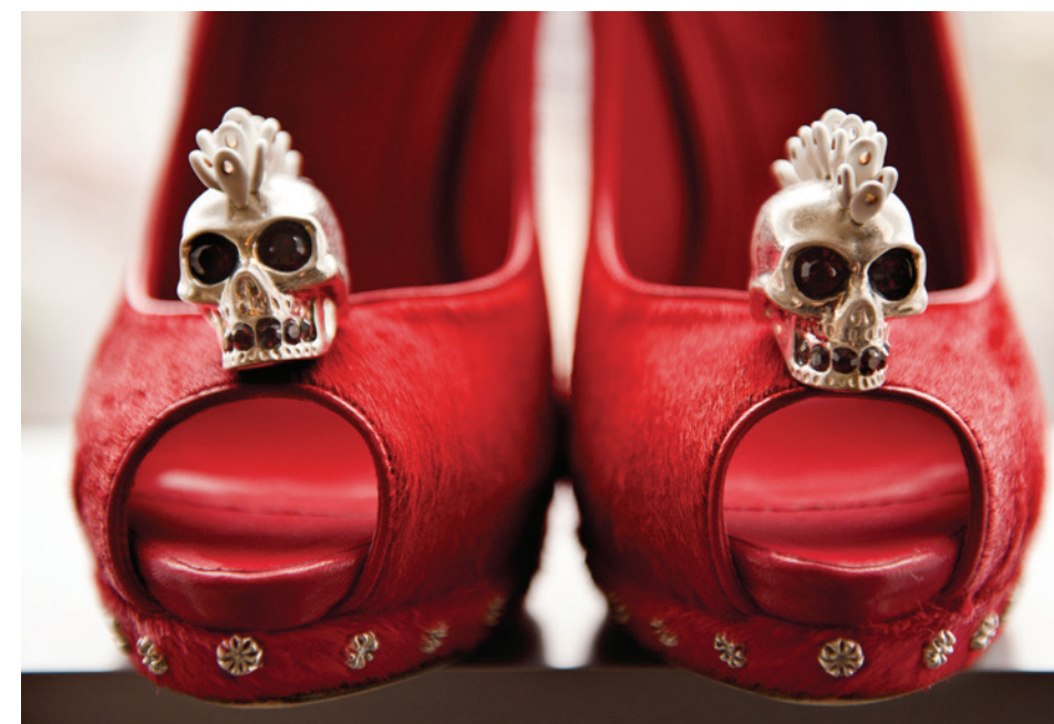
A pair of red, limited edition Alexander McQueen calf hair peep-toe pumps (complete with silver skulls and ruby eyes) completed the fashion-forward ensemble.